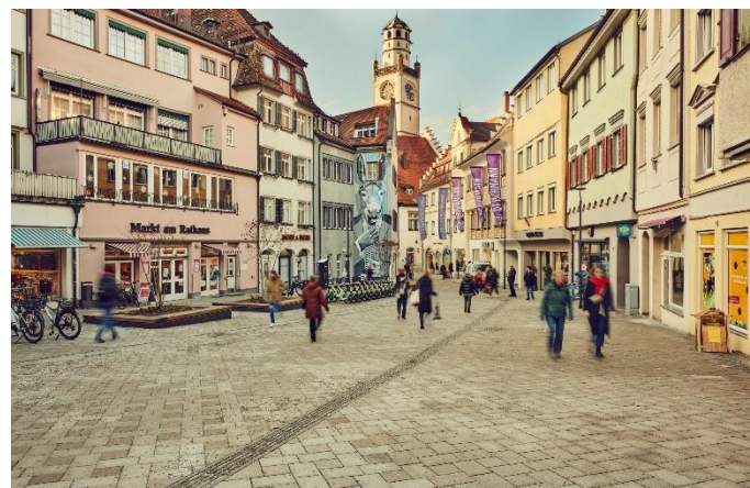
© 2022 Ministerium für Verkehr Baden-Württemberg CC BY-ND <u>https://creativecommons.org/li</u> <u>censes/by-nd/4.0/</u>