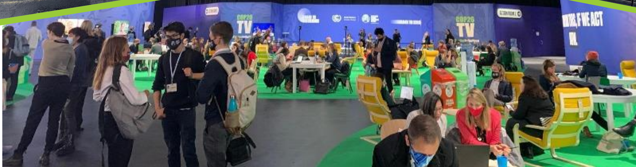
COP26, Glasgow, November 2021