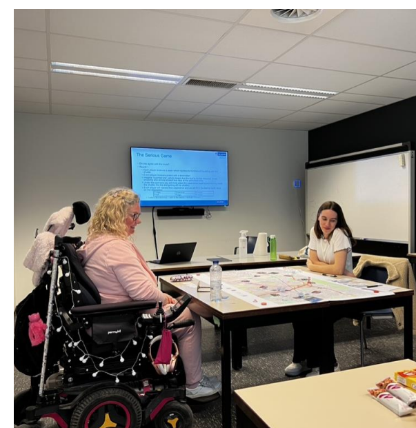
KU Leuven with person with impairments April, 2022