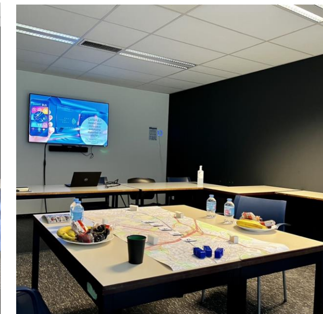
KU Leuven with children April, 2022