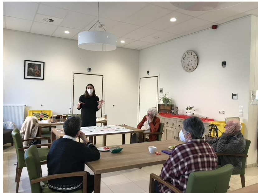
Zaventem with Sint-Antonius March, 2022