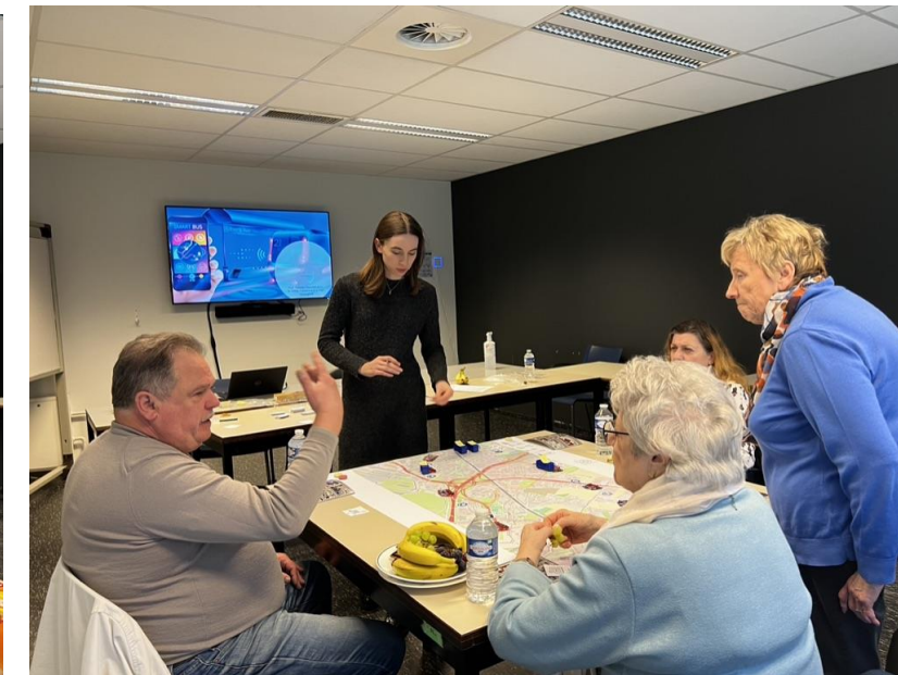
KU Leuven with OKRA April, 2022