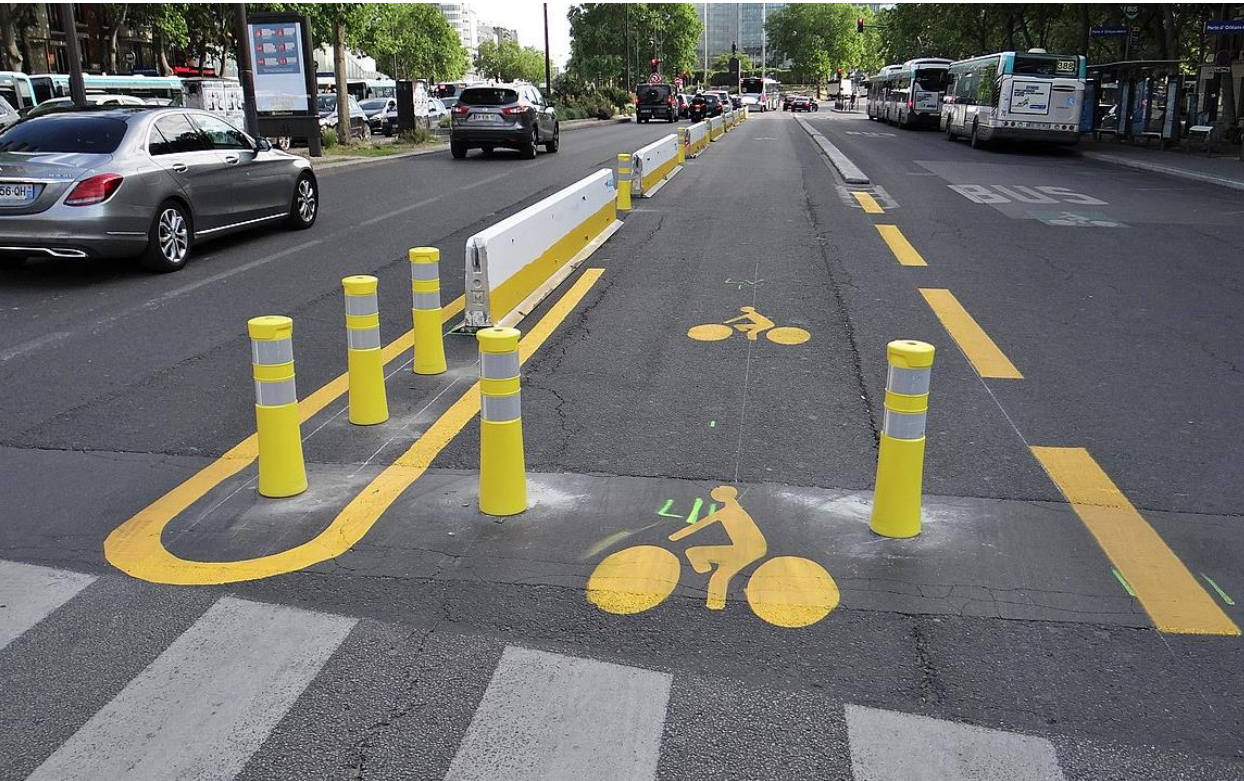
Inside city centres