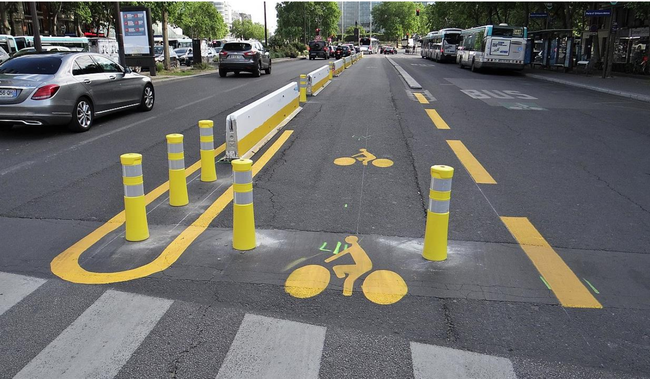
Inside city centres