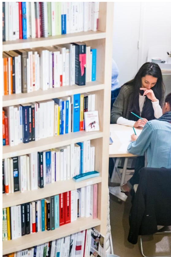
bookshops and cultural businesses