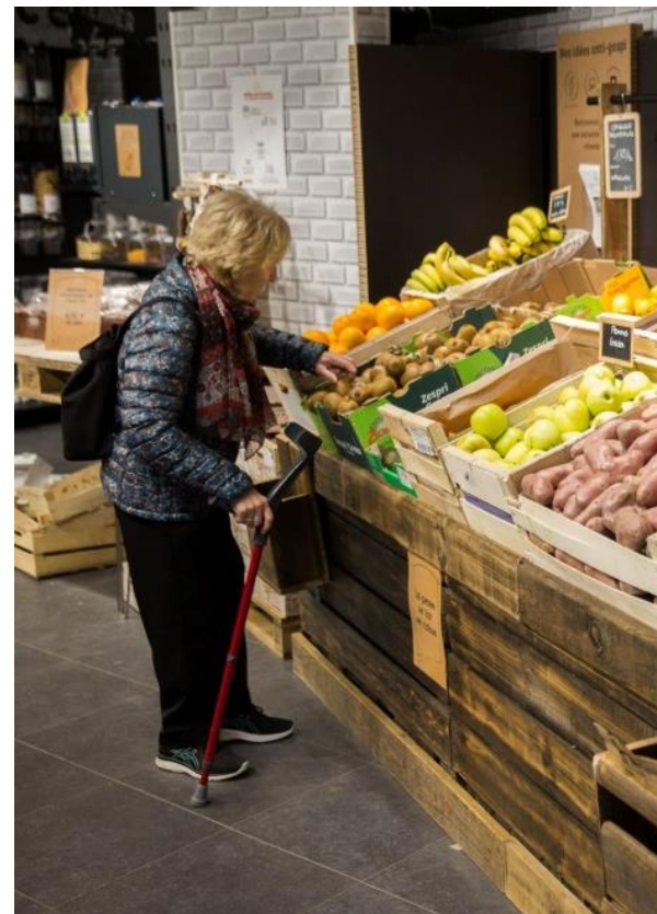
Social & ecological projects