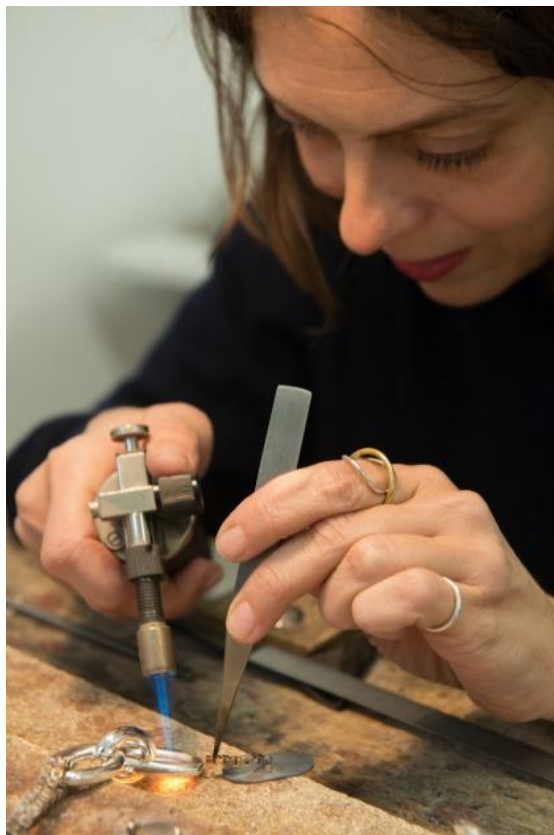
Arts & crafts