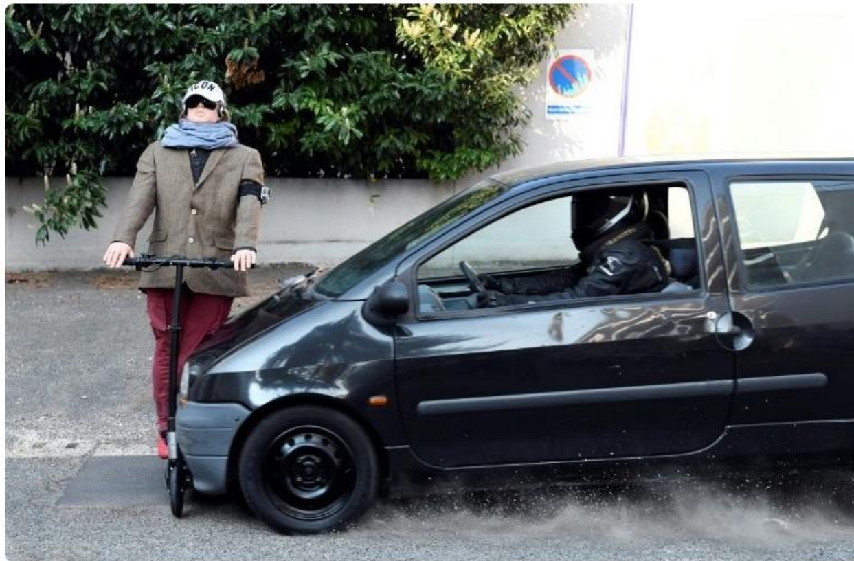
Simulation d'un accident entre une voiture et un mannequin à trottinette, le 12 avril 2019 à Paris