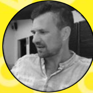
Founder | COO

Social entrepreneur, father of two, experienced creative and forward thinker. Has developed a social hotel-company in Mozambique and two restaurant formulas in the Netherlands. Design director by trade and a real cycling enthusiast.