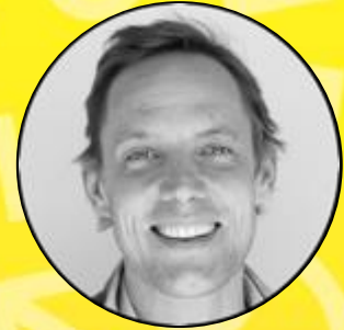
Founder | CCO

Strategic sales expert with an established international network. Well connected in the political, semi-public and public domain with decision makers in the field of MaaS (Mobility as a Service). Father of two sons.