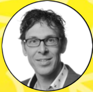
Founder | CEO

Entrepreneur with a great deal of experience in complex IT-developments with many stakeholders involved. Successfully exited his previous companies. Father of 4, lives in Amsterdam.