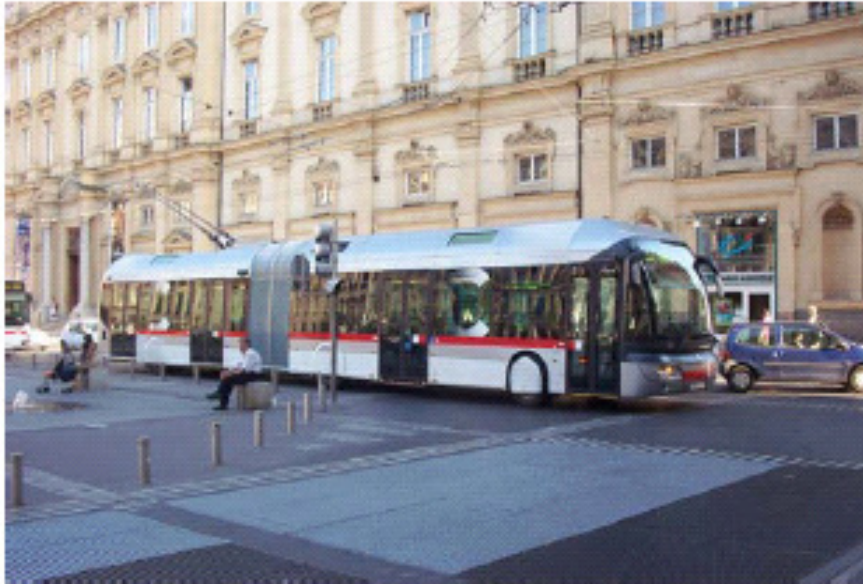
Fig.4 Electrical traction vehicles