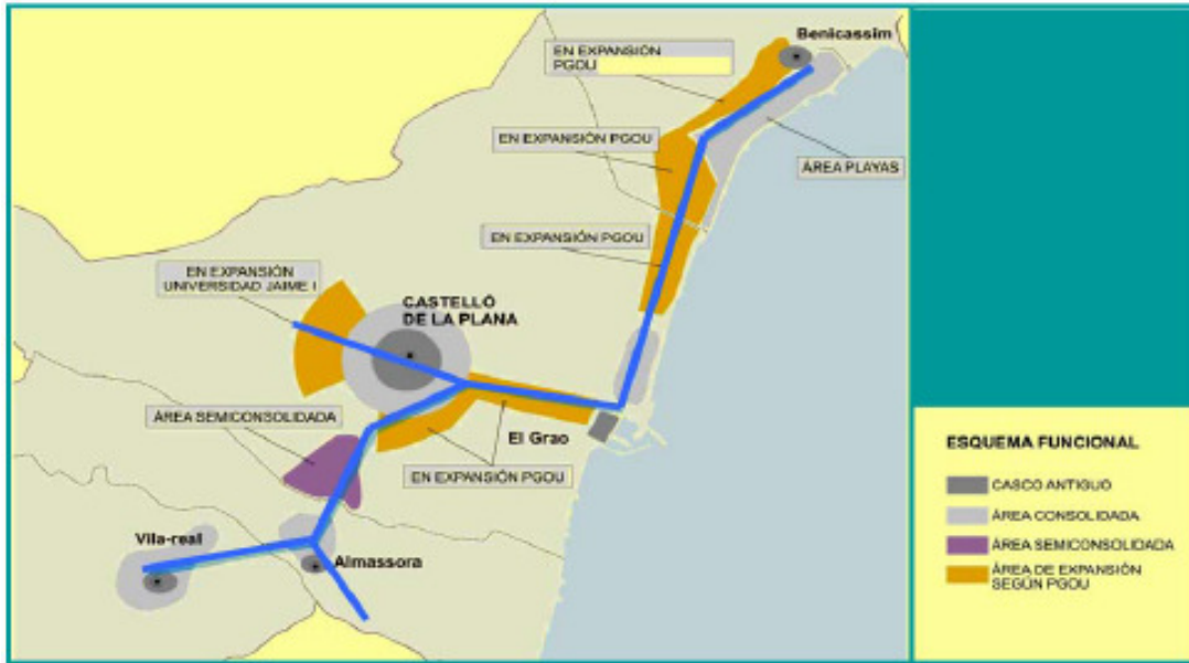
Fig.1 Area map with planned system trajectory

This demonstrator will provide considerable flexibility in operations. A suitably adapted bus/tramway could travel on a guideway where this is available but could also travel on any other part of the road network as required, something especially useful in the city centre, so the guided bus/tramway system to be implemented in the demonstrator provides a lower cost alternative to light rail while having the advantages of dedicated rights of way.