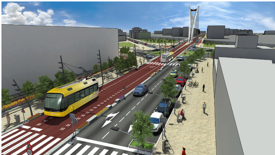
Fig.2 Example of a dedicated lane segregated from the normal traffic

This demonstrator will provide considerable flexibility in operations. A suitably adapted bus/tramway could travel on a guideway where this is available but could also travel on any other part of the road network as required, something especially useful in the city centre, so the guided bus/tramway system to be implemented in the demonstrator provides a lower cost alternative to light rail while having the advantages of dedicated rights of way.