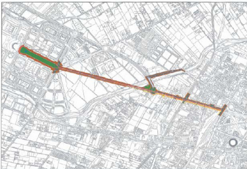
Fig.5 Demonstrator trajectory

The next figure shows the Demonstrator trajectory in the city of Castellón: