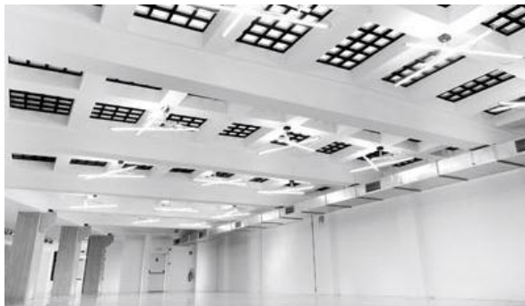
Area 4 with a ceiling made from glass blocks, will host the exhibition, cocktail, coffee breaks and lunches.

A map of the conference venue and of the exhibition space can be provided on request.