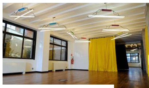
Parallel sessions will take place in dedicated workshop areas