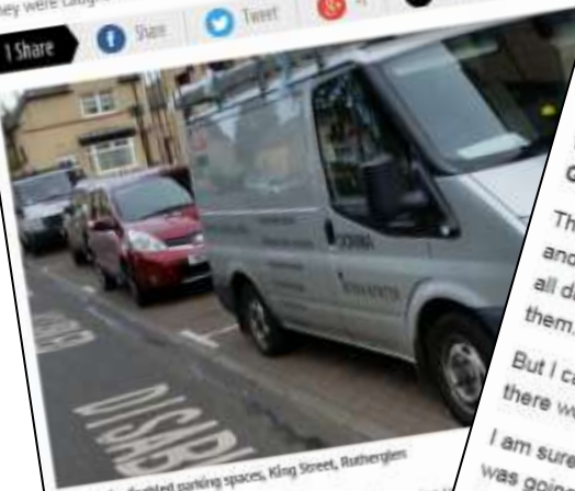
Workers in disabled parking spaces, King Street, Rutherglen

Workmen were caught flouting disabled parking rules in two disabled parking bays on King Street. The workers were snapped parked in two disabled parking bays on King Street.