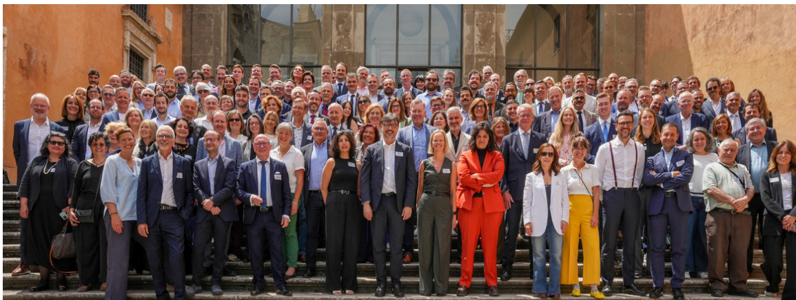
Rome Leadership Summit in May 2025 — POLIS

The next edition will take place in Zagreb, Croatia , on 26 May 2026 . Register for the 2026 Leadership Summit here .